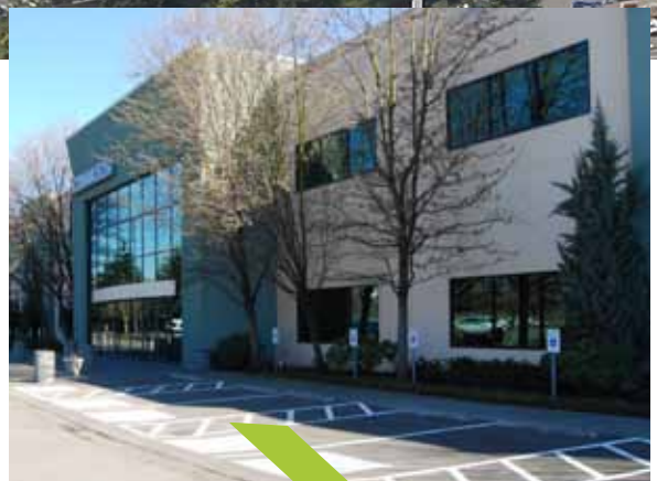
RIVERFRONT TECHNICAL PARK

Riverfront Technical Park has approximately 65,000 square feet of office space available on both the first and second floors.