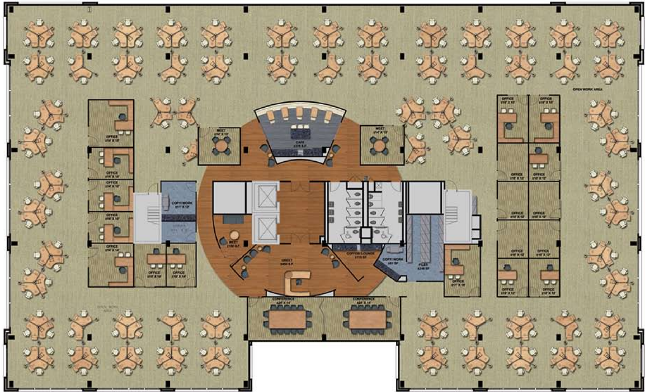
ICE HOUSE BUILDING SINGLE TENANT STUDY